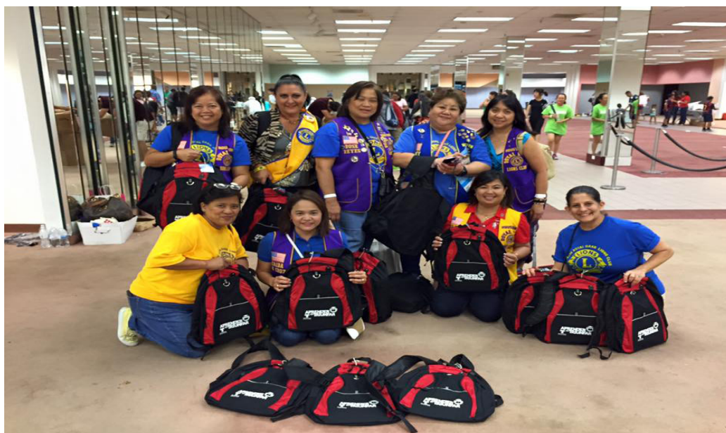
Houston Royal Oaks Backpack Project