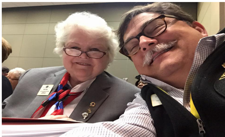
Vice District Govrmors goofing around at the USA/CANADA Leadership Forum