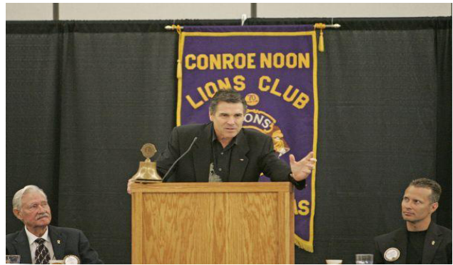
Texas Governor Rick Perry delivers a luncheon speech Wednesday at the Conroe Noon Lions Club meeting.