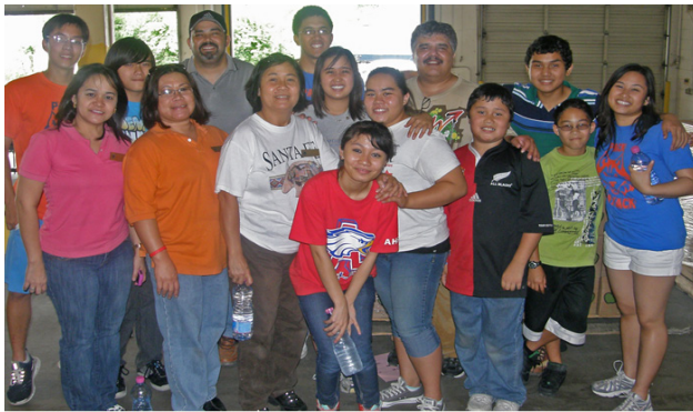
Houston Royal Oaks Lion's Club May 16, 2009 Helped provide 32,396 meals houston foodbank Filling pantries. Filling lives.