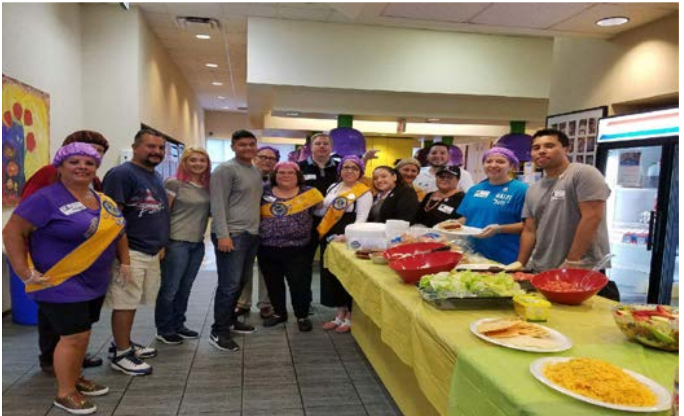
Houston Lady Lions Club work at the Ronald McDonald Holcome House