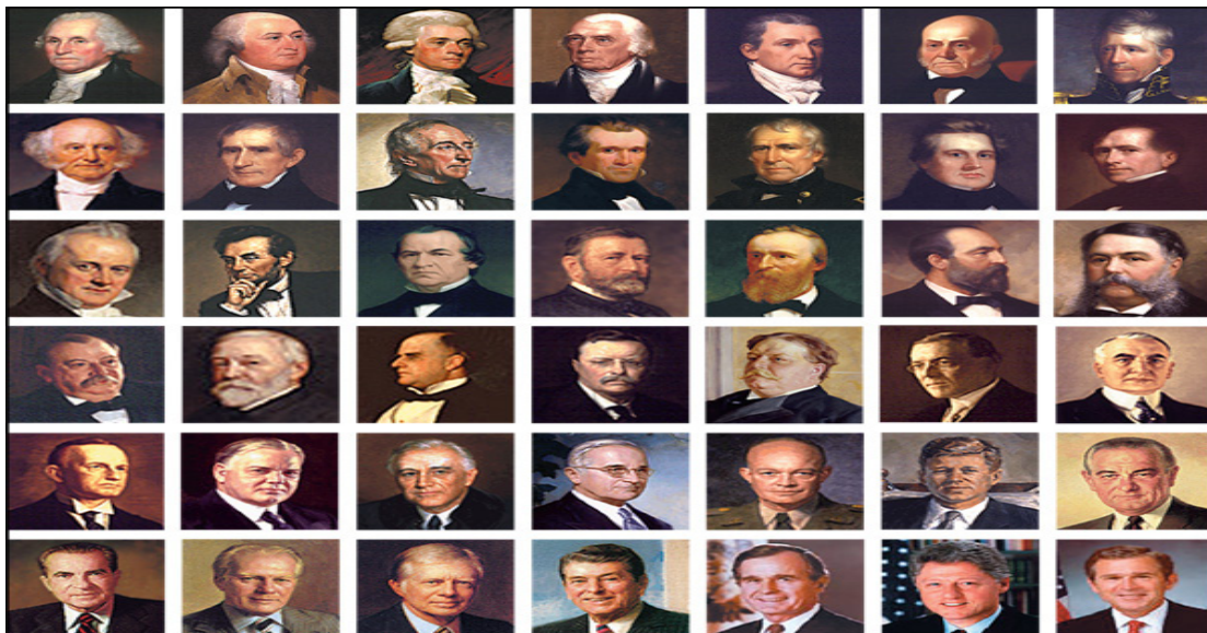
George Washington John Adams Thomas Jefferson James Madison James Monroe John Quincy Adams Andrew Jackson Martin Van Buren William Henry Harrison

If you're looking for a really special way to celebrate this year, consider a trip up the Potomac River to Washington, DC. February 12, 2009 will mark the bicentennial of the birth of Abraham Lincoln and the Nation's Capitol is planning to celebrate in high style with more than 80 exhibitions, performances, lectures, and guided tours honoring Abraham Lincoln. Beginning January 1 and running through April 30, the nation's capital will offer an impressive lineup of major events and commemorations of one of America's best-loved leaders. Don't forget to stop by the Portrait Gallery if you want to see some of the best paintings of our leaders from Washington to Bush. By the time summer comes around, there will surely be one new portrait added to the collection.