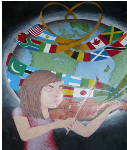
The Winning Peace Poster For MD-2 2007-2008 Lions District 2-S2

To chaperone next year, please contact one of your elected Lighthouse directors.